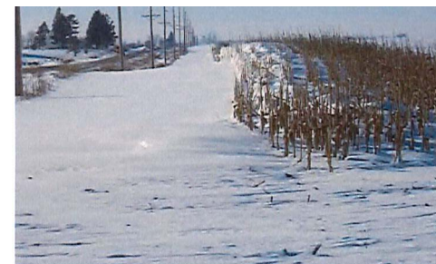
An example of a standing corn fence. Notice the snow trapped between the stalks.

The County will pay the tenant or landowner based on its FSA reported yield or monitored harvest yield. Price per bushel is determined using the county-wide average cash price on August 1 st each year plus $2.00 per bushel for October new corn price. Agreements only go from fall to spring and can be renewed each year.